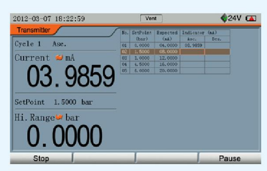
Pressure gauge / transmitter / switch calibration