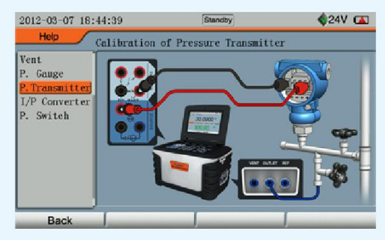
Built-in User's Manual