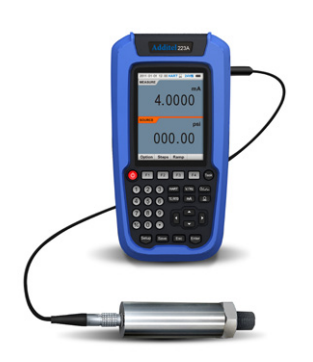
Additel 223A with ADT160A Pressure Module