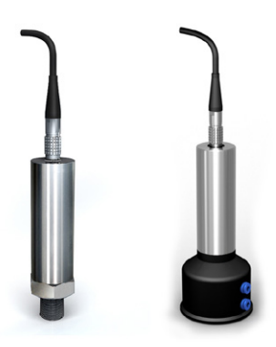
Gauge pressure Differential pressure