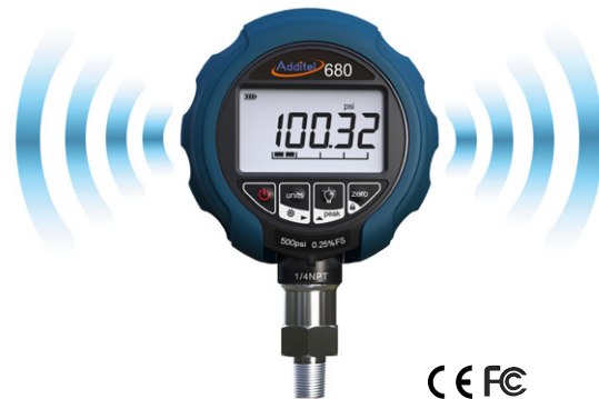
680 with data logging and wireless (optional)