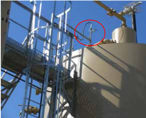
IS-20-VR installed on salt water disposal system tank

Note: additional specifications are available on data sheet IS-20. Options listed on the IS-20 data sheet are not available on the IS-20-VR version.