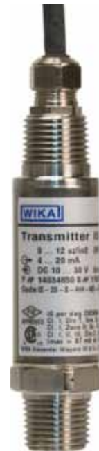
IS-20-VR pressure transmitter

The IS-20-VR can also be used for liquid level monitoring down to 0-20 inches water column (0-12 oz/in 2 ) and is sensitive enough to detect level changes as small as \pm 0.05 inches.