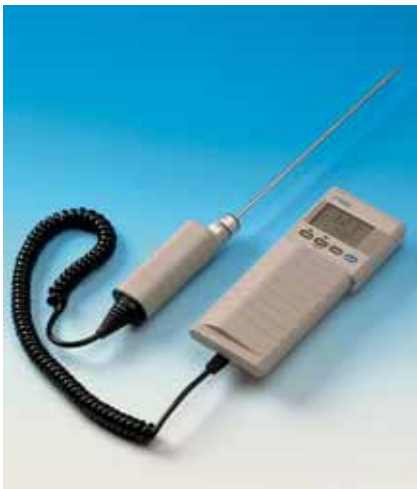
HMI41 with the HMP42 probe.