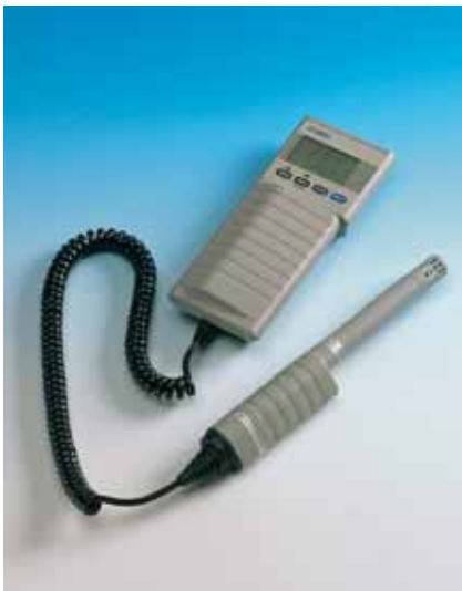
HMI41 with the HMP45 probe.