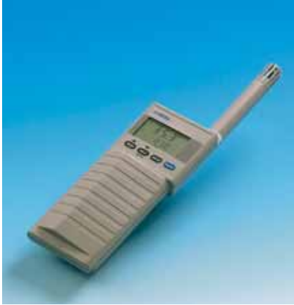
The HMI41 indicator with the HMP41 probe.