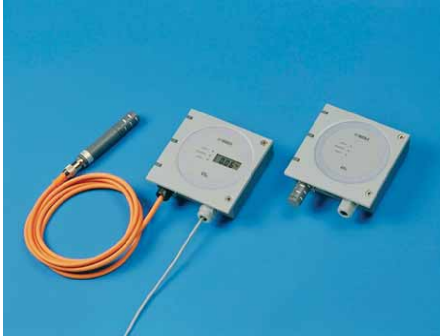
Vaisala CARBOCAP® Carbon Dioxide Transmitter Series GMT220 withstand harsh and humid environments.

The Vaisala CARBOCAP® Carbon Dioxide Transmitter Series GMT220 is designed to measure carbon dioxide in harsh and humid environments. The housing is dust and waterproof to IP65 (NEMA 4) standards. The materials have been chosen for good corrosion resistance.