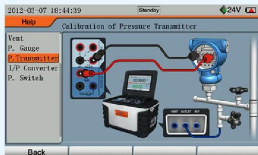
Built-in User's Manual